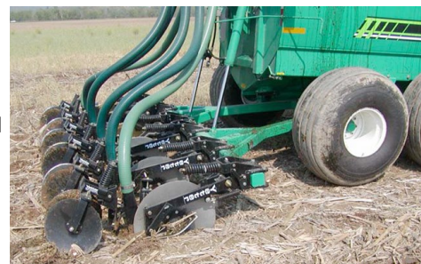
Figure 1: VA Tech's shallow, coulter-type slurry injector used in this demo project