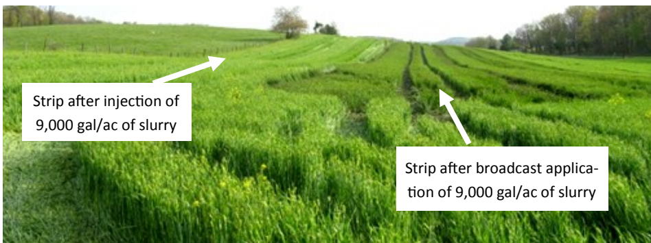
Figure 4. Field view after application of manure treatments to a standing cover crop prior to corn planting at Colebelle Dairy. The coulter injector was remarkably good at placing manure into the soil under large amounts of residue and vegetation.