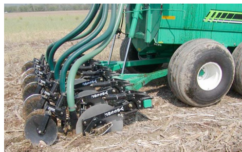
Figure 1: VA Tech's shallow, coulter-type slurry injector used in this demo project