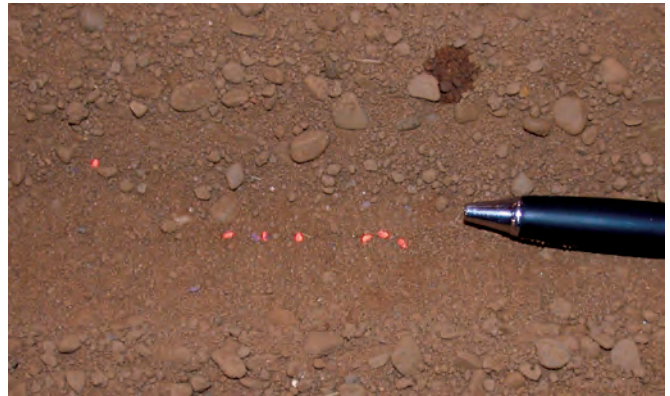
Figure 3. A small amount of painted seed added to the seed box can help determine seeding depth.

After calibrating the drill, plant test strips to determine the depth at which seed is being planted. Small seeds are difficult to see in the row. A small amount of seed can be spray painted bright orange and allowed to dry thoroughly, mixed with plain seed and placed in the drill seed box immediately above each seed outlet. The colored seed is easily seen in the row. ( Note: Make sure the painted seed has dried completely before putting it in the drill. Otherwise it