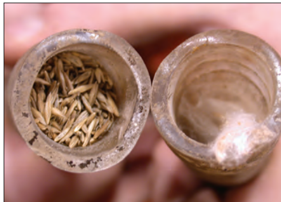
Figure 1. Seed tube on left plugged with old seed from a previous use and tube on right plugged with a spider web. All seed tubes should be checked for obstructions before each use to avoid skipped rows resulting from plugged tubes.

This method can be used to calibrate the drill before entering the field. Become familiar with the calibration mechanism on the drill before starting the calibration procedure. Some no-till drills have a single control meter for adjusting the seed flow from the seed box. Others have two control meters, one for each side of the seed box. In that case, the seed flow must be checked for both sides of the seed box. Because of equipment wear or uneven adjustment, it is common for each control meter to have a slightly different setting to deliver the same rate of seed.